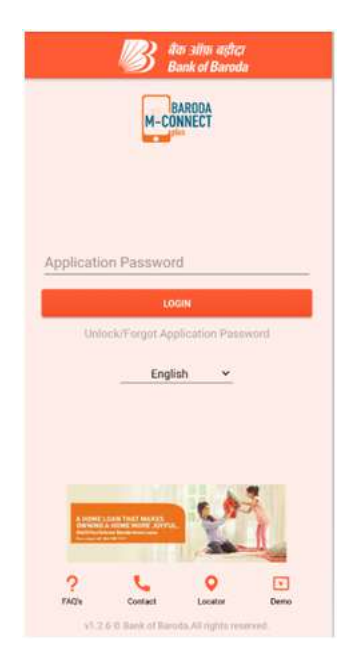
Login and get Started!