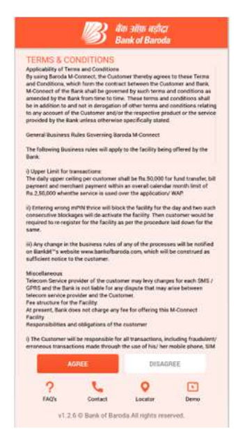
Agree on Terms and Conditions