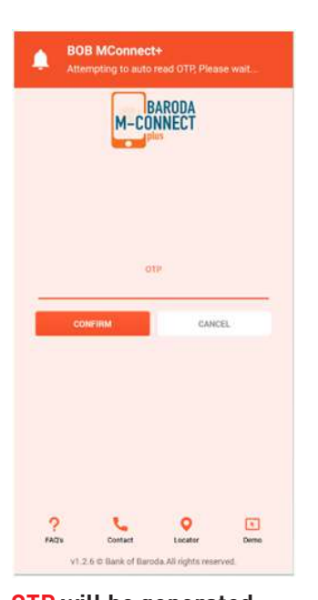
OTP will be generated & Auto - read