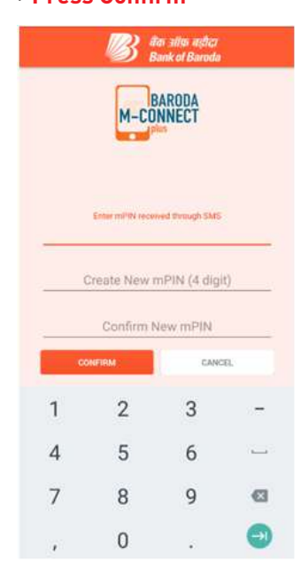
1st Field: Enter mPIN received through SMS 2nd& 3rd Fields: Create own mPIN