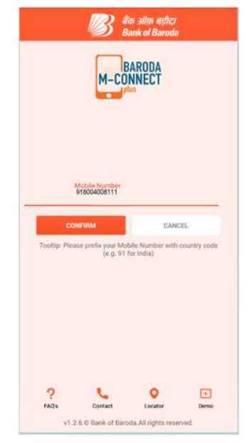
Your registered Mobile No. will be fetched >Press Confirm