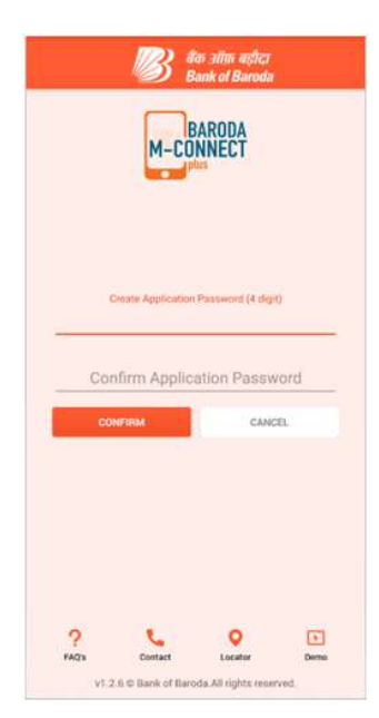
Create your Own Application Password