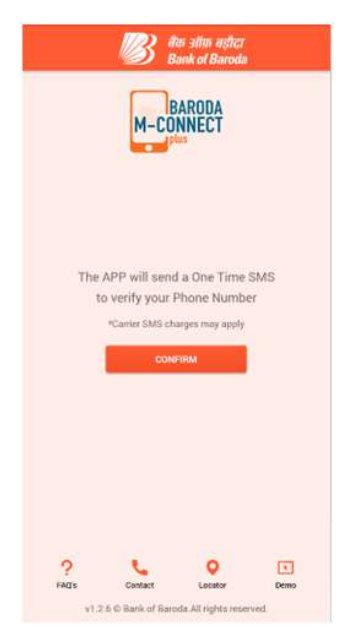
Press Confirm > app will send one time SMS

GOOGLE PLAYSTORE (for Android users) APP STORE (for iOS users) WINDOWS STORE (for Windows users)